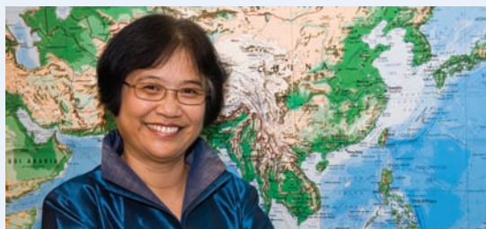
College of Lake County's semester-long program in China will become a permanent program sponsored by the Illinois Community College Consortium of International Studies and Programs.