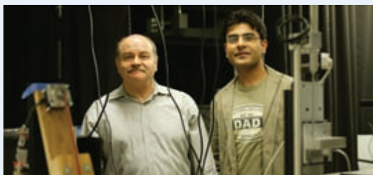
California Institute of Technology and École Polytechnique based their dual degree program on a pre-existing relationship.