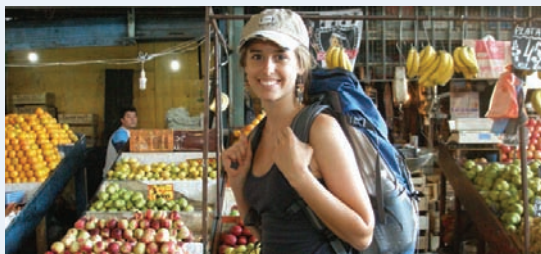
Georgia Tech's curriculum internationalization initiative encompasses 8 of the 11 engineering majors.