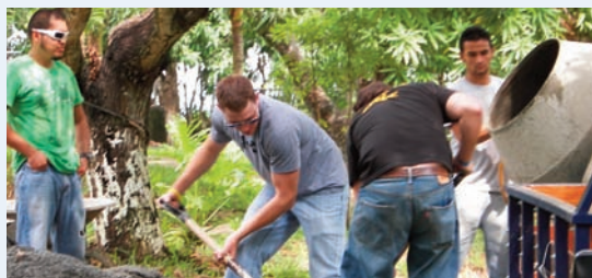
Angelo State University students work at an orphanage in Costa Rica as part of a summer study abroad program.