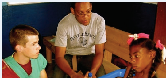
Washington & Jefferson students worked at a clinic in the Dominican Republic while studying abroad.